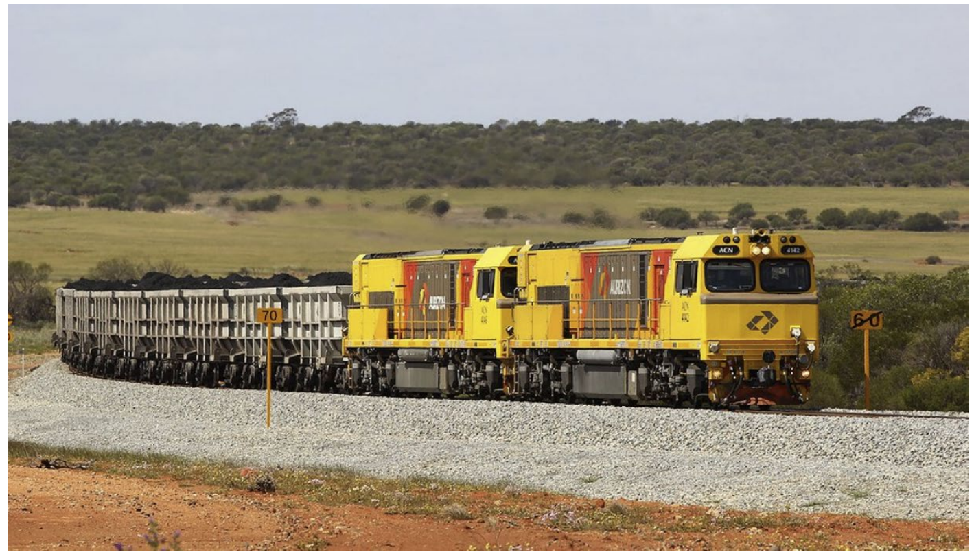
Figure 5 – Magnetite concentrates will be loaded on to dedicated ore trains at proposed Hillgrange intermodal facility for transport to port (stock image).