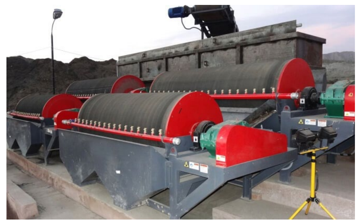
Figure 4 – Conventional magnetite beneficiation technologies will be used for ore processing including wet magnetic separation (stock image).