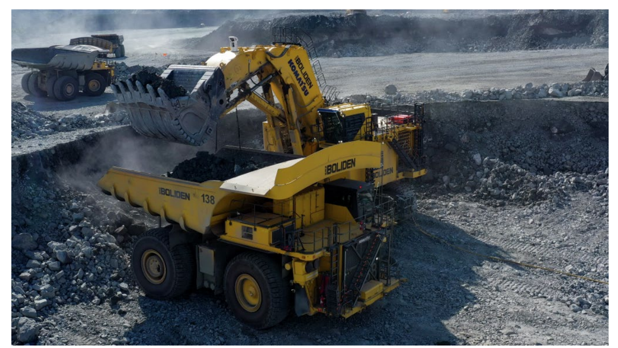
Figure 3 – Conventional open pit mining operations will be used to mine the Iron Peak and Razorback ore deposits over an initial 38-year mine life (stock image).