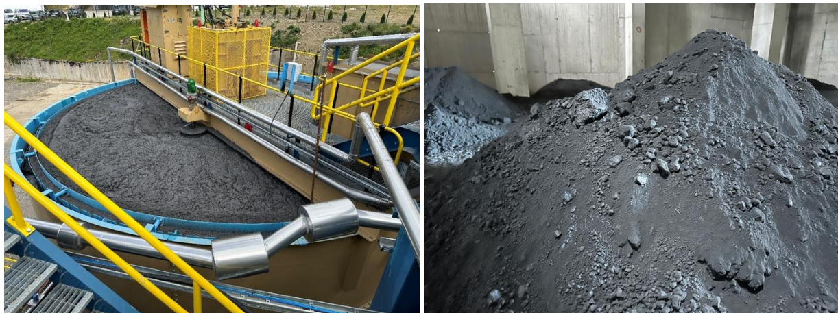
Figure 1: Processing at the Vares Processing Plant and stockpiled concentrate