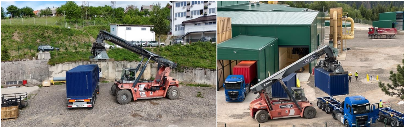
Figure 4: Loading of the concentrates onto trucks to travel to Ploce Port at the Vares Processing Plant