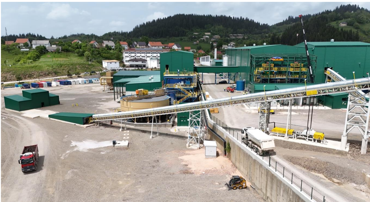
Figure 5: Vares Processing Plant