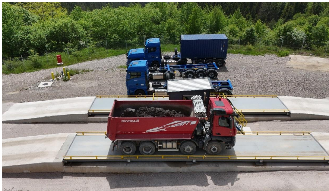
Figure 6: Weighing of trucks