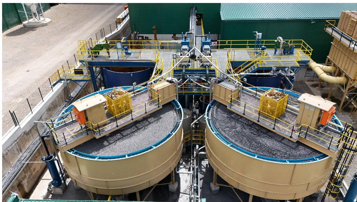
Figure 3: Vares Processing Plant