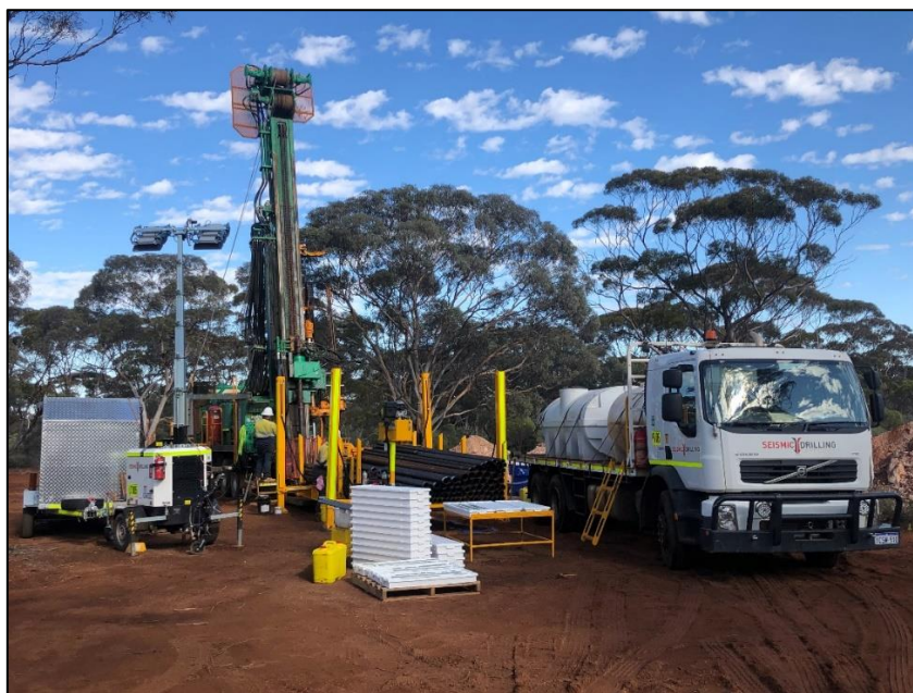
Photograph 1 – Seismic Drilling’s diamond drill rig underway on the first Nepean Deeps hole NPDD008

The geological and geophysical results from the first two holes will be used to plan another four drill-holes to test high-priority targets within the Nepean Deeps target area for nickel sulphide mineralisation, thus expanding the maiden drill programme to six proposed drill-holes.