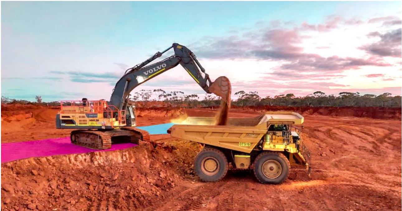
Figure 1: First Ore being loaded at the Myhree open pit (pink >3.0g/t Au, blue <3.0g/t Au).

Black Cat’s Managing Director, Gareth Solly, said: “ This is a significant milestone for Black Cat and it is only fitting that first Ore was mined from Myhree, the Company’s inaugural discovery back in 2019. MMS is making excellent progress both on a safety and productivity front in developing Myhree/Boundary, with 24-hour load and haul operations underway and Ore stockpile construction underway. ”