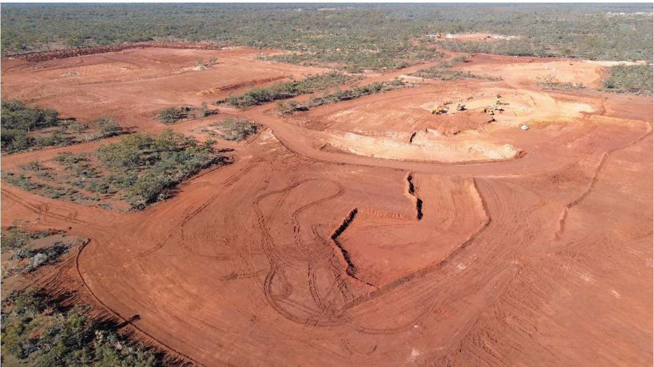
Figure 3: Aerial view of open pit (looking south)