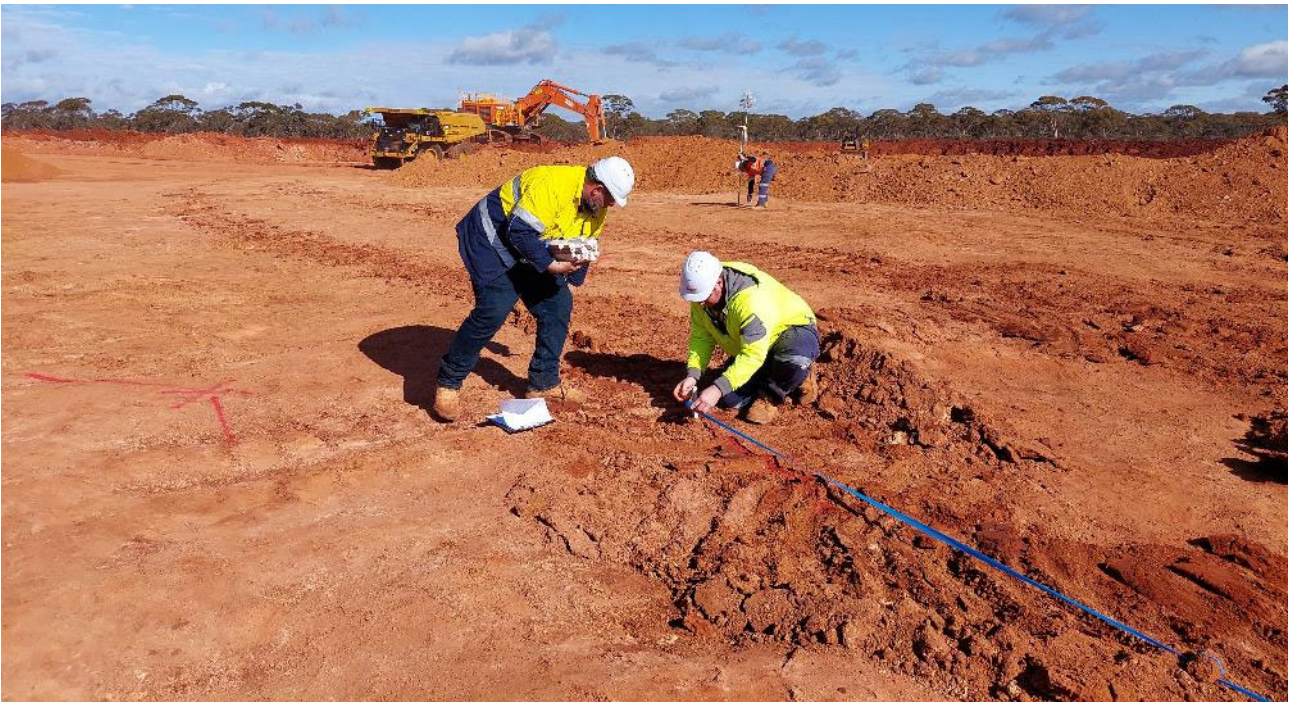
Figure 2: First Ore being marked up at the Myhree open pit (pink >3.0g/t Au, blue <3.0g/t Au).

Ore mining and 24-hour operation is underway at Myhree/Boundary with first ore mined on 26 July 2024.