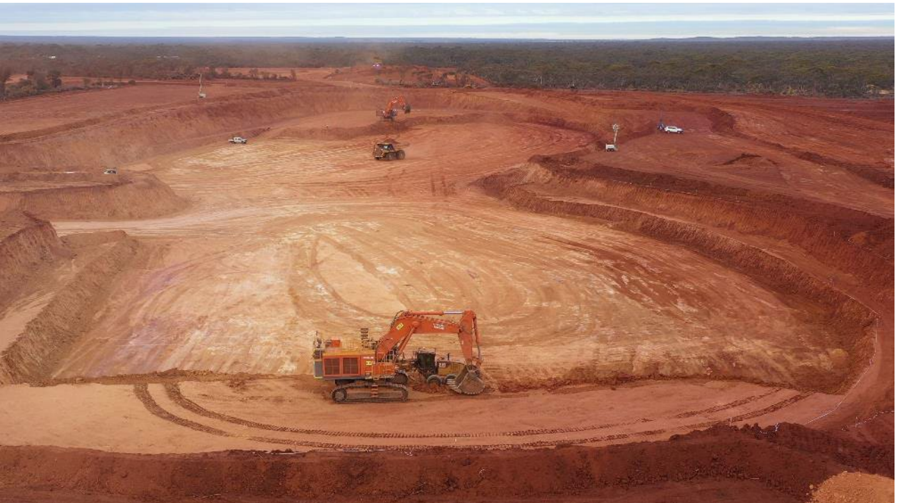
Figure 3: Aerial view of the Myhree open pit (looking south)