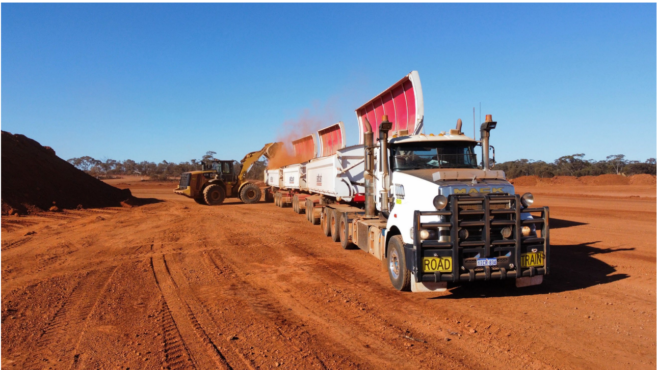
Figure 1: First Ore being loaded from the first stockpile for transport to Paddington.

Black Cat’s Managing Director, Gareth Solly, said: “ Excellent progress is already being made in free-dig material with ore haulage a month ahead of plan. With a 200t excavator arriving this month to further increase material movement, the current trajectory will continue. ”