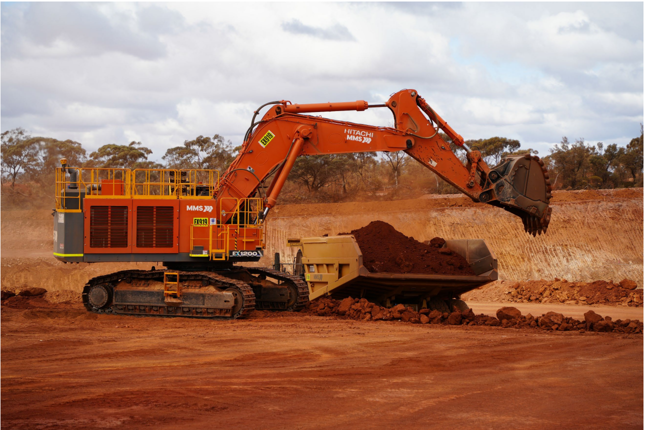
Figure 2: New 100t excavator conducting low cost, free-dig operations in the Myhree open pit

Ore mining and a 24-hour free-dig operation is underway at Myhree/Boundary with first Ore mined on 26 July 2024.