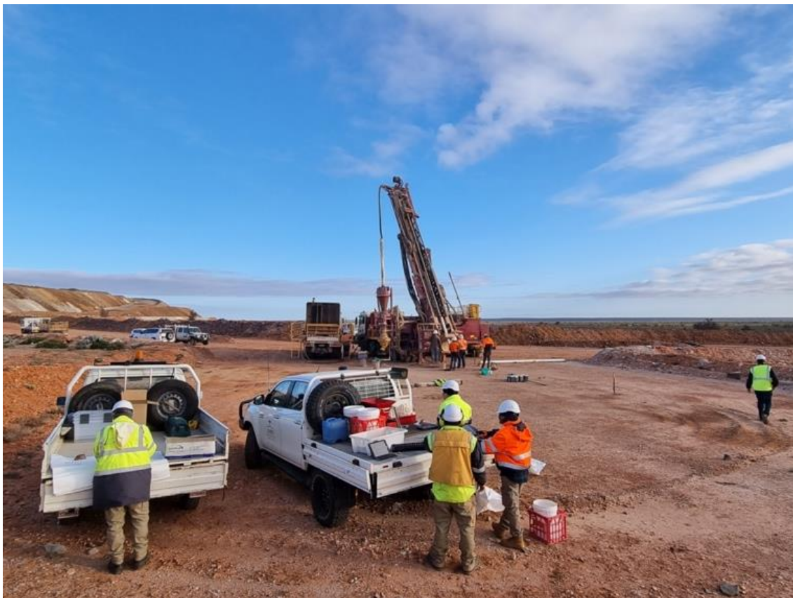
Figure 1 – Tarcoola Phase 2 Drilling at Perseverance North (July 2021)

A total ~2.6km 2 surrounding the Perseverance Mine was surveyed by GPR, at a line spacing of ~20 metres.