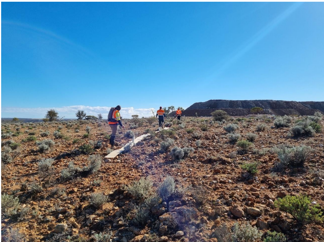
Figure 3 - Tarcoola Ground Penetrating Radar Survey on ML6455 (July 2021)

Based upon guidance from the Company's assay laboratory and GPR team, the Company anticipates the receipt of Tarcoola Phase 2 gold assays and final GPR survey data within approximately 4 - 6 weeks' time.