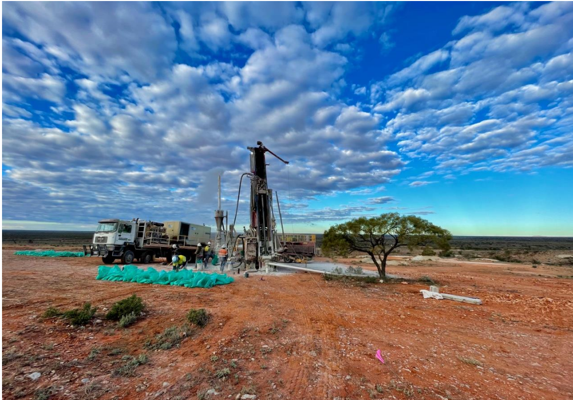
Figure 2 - Tarcoola Phase 2 Drilling at Perseverance West (August 2021)