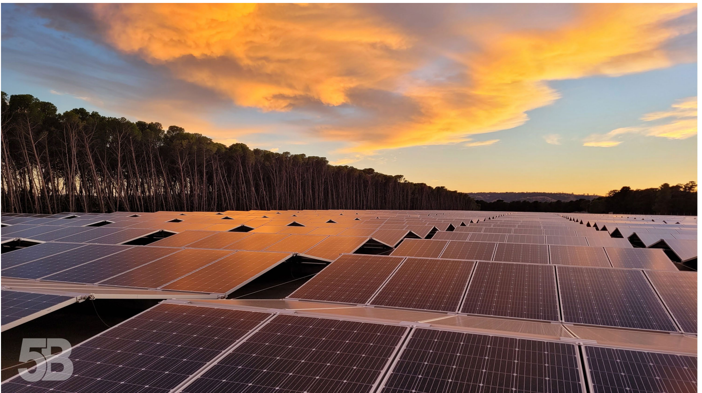
Figure 2 – Typical relocatable solar farm

This announcement has been authorised for release by the Board.