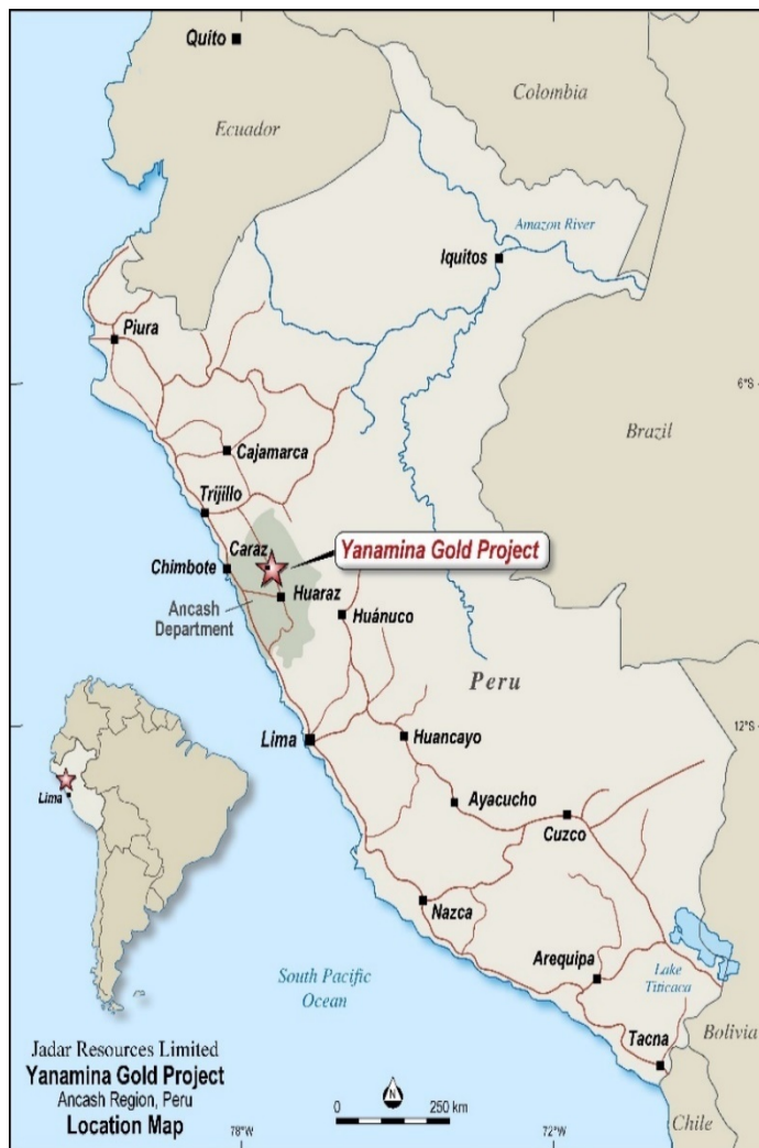
Figure 1: Regional Location

The Yanamina gold project is held through 5 mining concessions, Malu I, II, III, Monica T and Gladys E, with a total area of 918.66 hectares. The main concession, Malu I, which covers the Yanamina resource, has an area of 224 hectares and lies within the “buffer zone” adjacent to and around the Huascarán National Park.