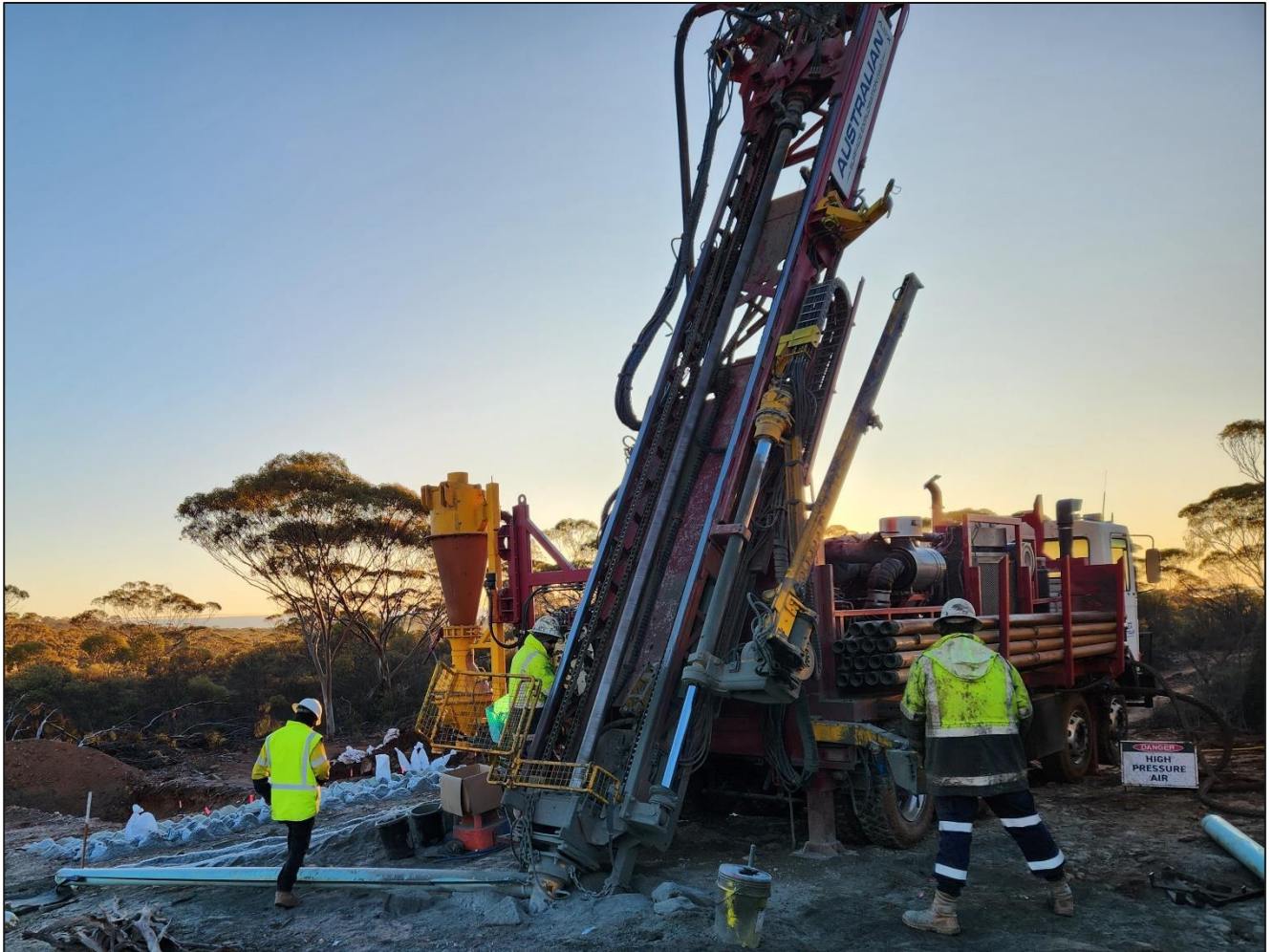
Figure 1: KHLP – Australian Surface Exploration’s RC Rig at Big Red (July 2023)

“The Phase 3 drilling programme signals an expansive next step in exploration at the KHLP. Work to date has successfully discovered shallow high grade spodumene bearing pegmatites at Big Red, highlighting the potential of the project. The RC programme will further test the exciting discovery at Big Red and Rocky, while also testing the recently defined high priority regional targets, all of which could substantially contribute to the success of the KHLP.”