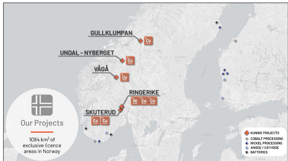
Location of Kuniko's projects in Norway