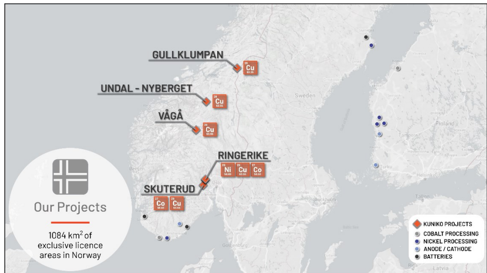
Location of Kuniko’s projects in Norway