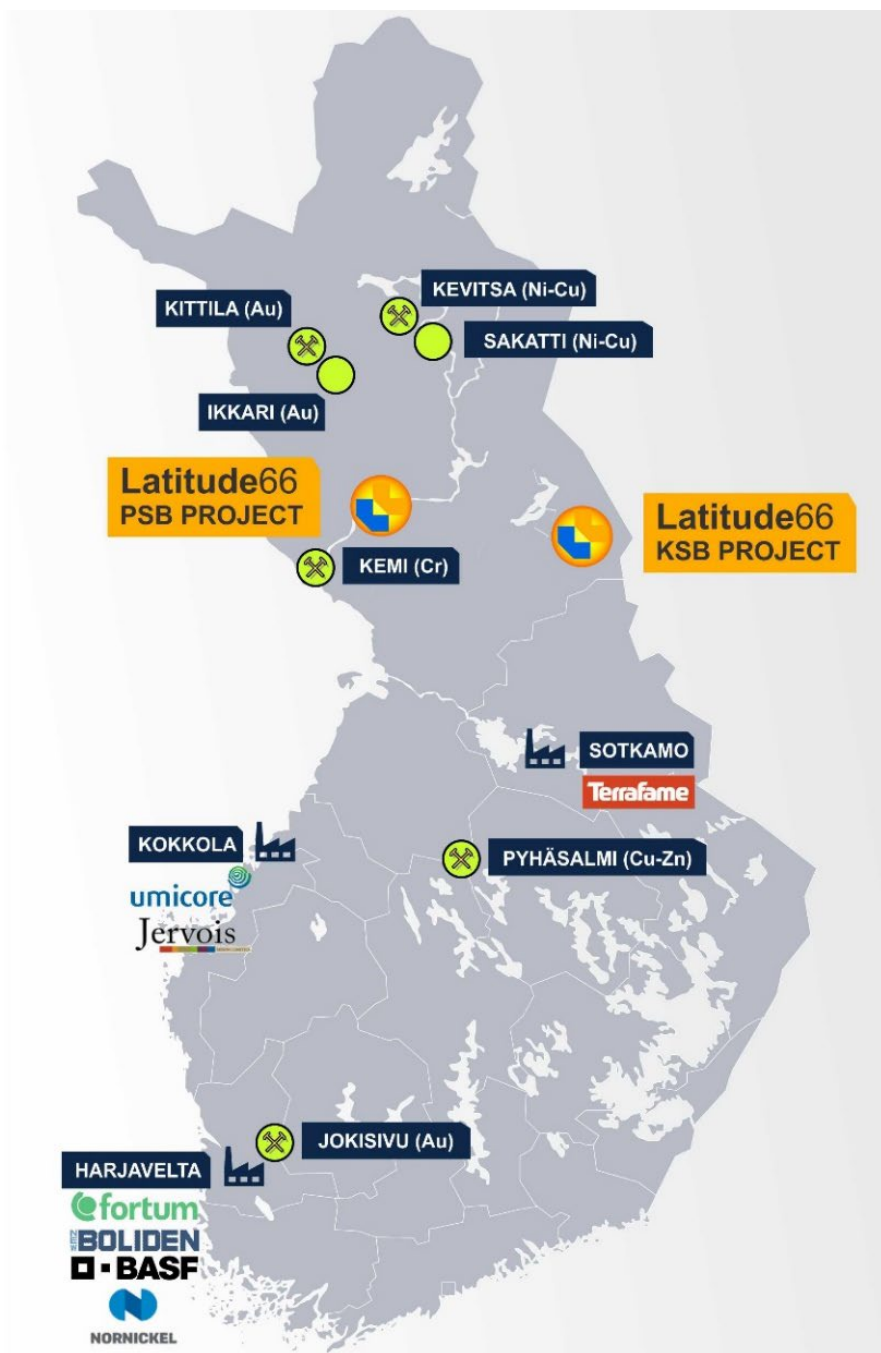
Figure 3: Latitude 66 PSB and KSB Project locations