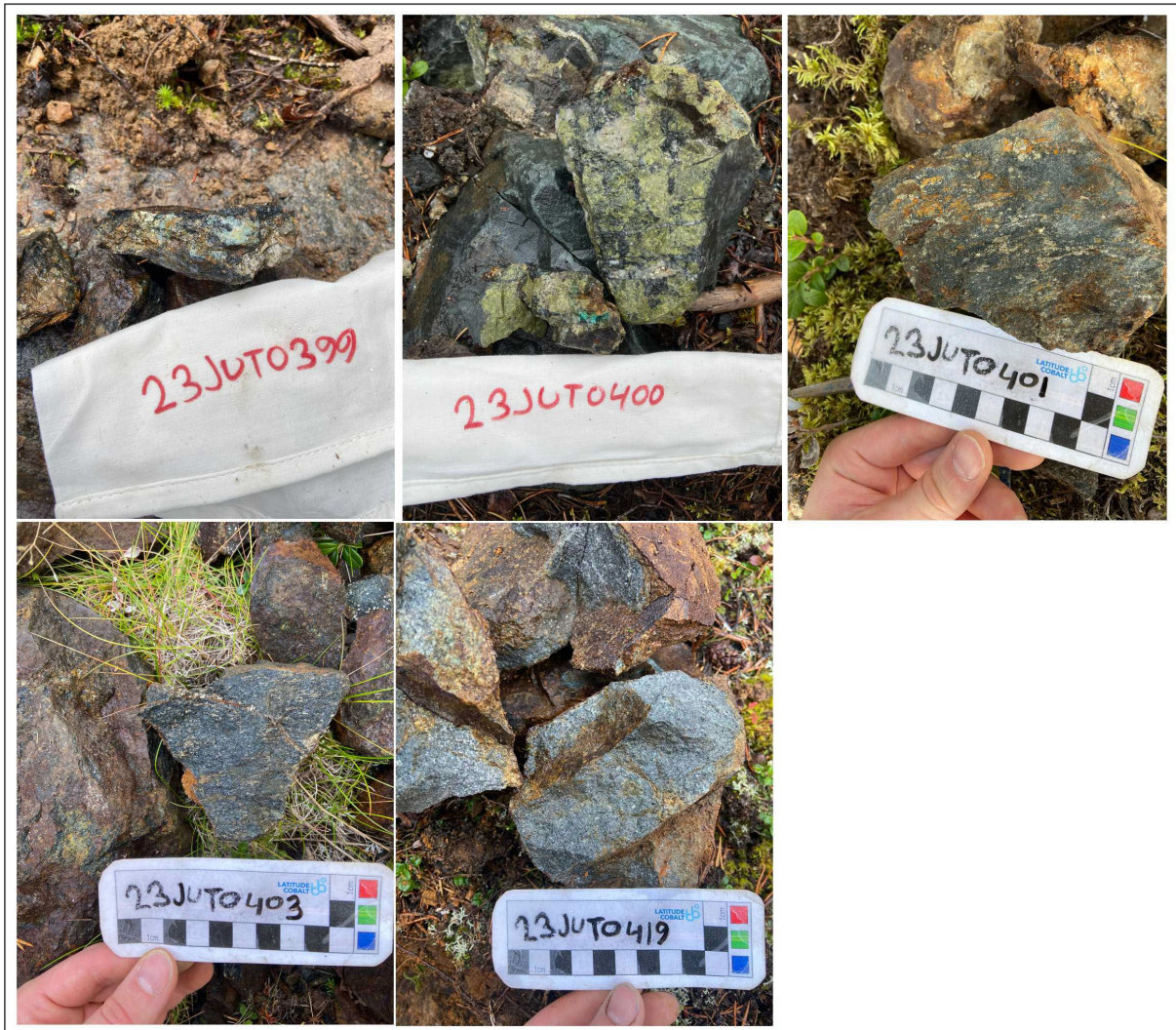
Figure 3: Hand specimens of reported Boulder Samples