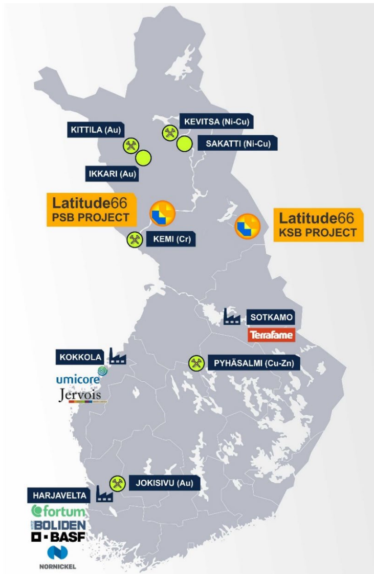
Figure 3: Latitude 66 PSB and KSB Project locations

Field activities to be completed in July to further investigate the prospective geological units (dolerites & other mafic intrusive rocks) at the Petaja, Reutu and Vinsa prospects, all of which have thin glacial till cover obscuring their exact locations. Ground-based prospecting, including traversing the interpreted outcrop positions of the dolerites, will be completed, with boulder and outcrop sampling to continue, together with investigation of structures, EM, IP and/or magnetics surveys to be completed at Petaja. Data acquired from the GTK, inclusive of base of till, diamond drilling and geophysics will also be processed and added to the PSB dataset.