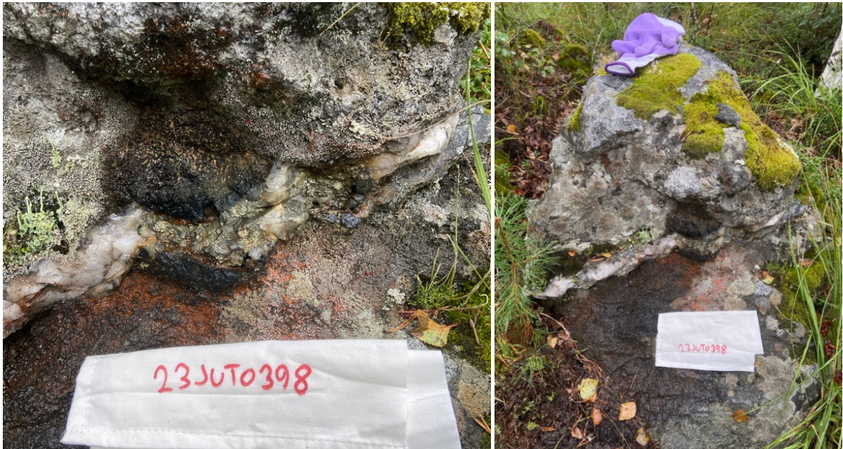
Figure 1: Dolerite boulder with mineralised veins from the eastern anomaly at the Petaja Prospect