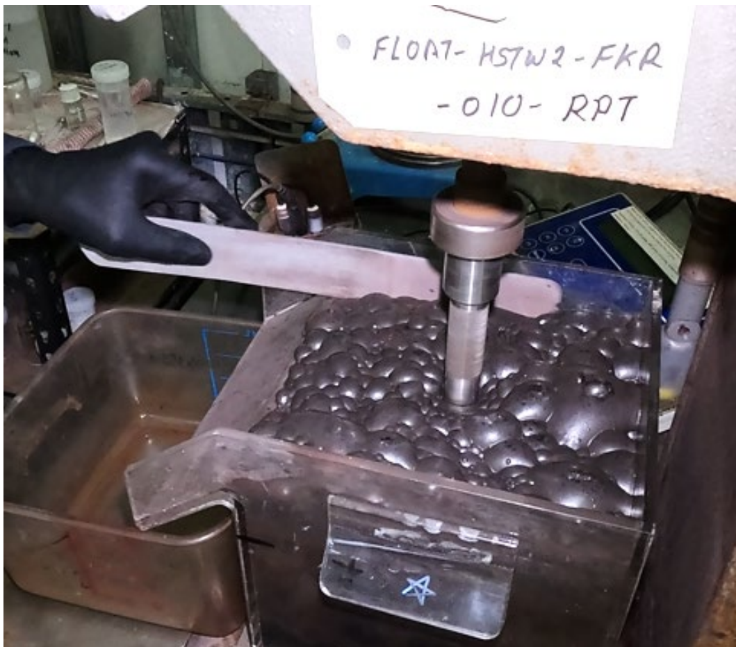
Figure 1 - Bench scale flotation testwork at Bureau Veritas laboratories, Adelaide

The testwork program utilised a composite bulk sample from the Iron Peak deposit, representing a limited portion of the planned mining inventory. 1,2 Accordingly, additional testwork is required to confirm the efficacy of saline water across all parts of the Razorback and Iron Peak deposits, which may exhibit different processing characteristics.