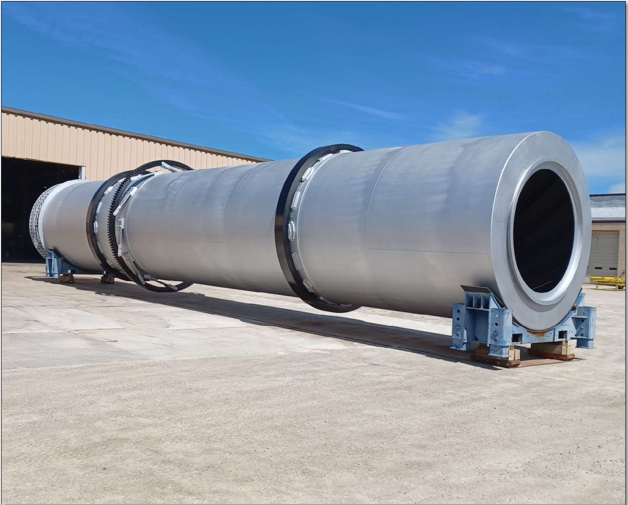
Figure 2 - Phosphate fertilizer plant dryer drum, ready to be shipped from FEECO headquarters USA.

In June 2021, the Company placed a US$6.5 million order to North American-based FEECO International 4 for the main CAPEX component of its Cabinda Phosphate Granulation Plant. The timing of the order was important to lock in equipment pricing in the face of rising cost of steel and other plant inputs.