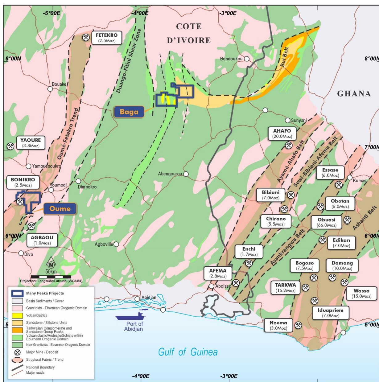
Figure 1: Baga and Oumé project locations on generalised regional scale geology interpretation

The intersection of multiple regional scale structures in combination with identification of previously un-mapped lithologic complexity associated with evidence of alteration, sulphide minerals proximal to shear corridors in reconnaissance mapping by Many Peaks highlight a highly prospective area to advance exploration activity.