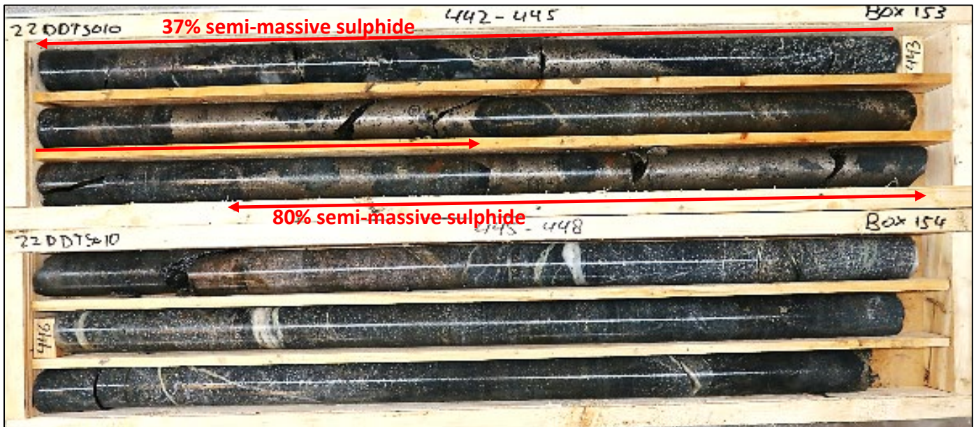
Figure 1: Semi-massive sulphides in the base of hole 22DDTS010 (442m-448m shown)

Ragnar Metals Limited (“Ragnar” or “the Company”, ASX: RAG) is continuing the 3,000m drilling program, led by Swedish drilling Allroc AB to further test the Granmuren nickel-copper discovery. Granmuren is located within the Company’s 100%-owned Tullsta Nickel Project in Sweden, 110km NW of Stockholm (“Tullsta” or “the Project”).