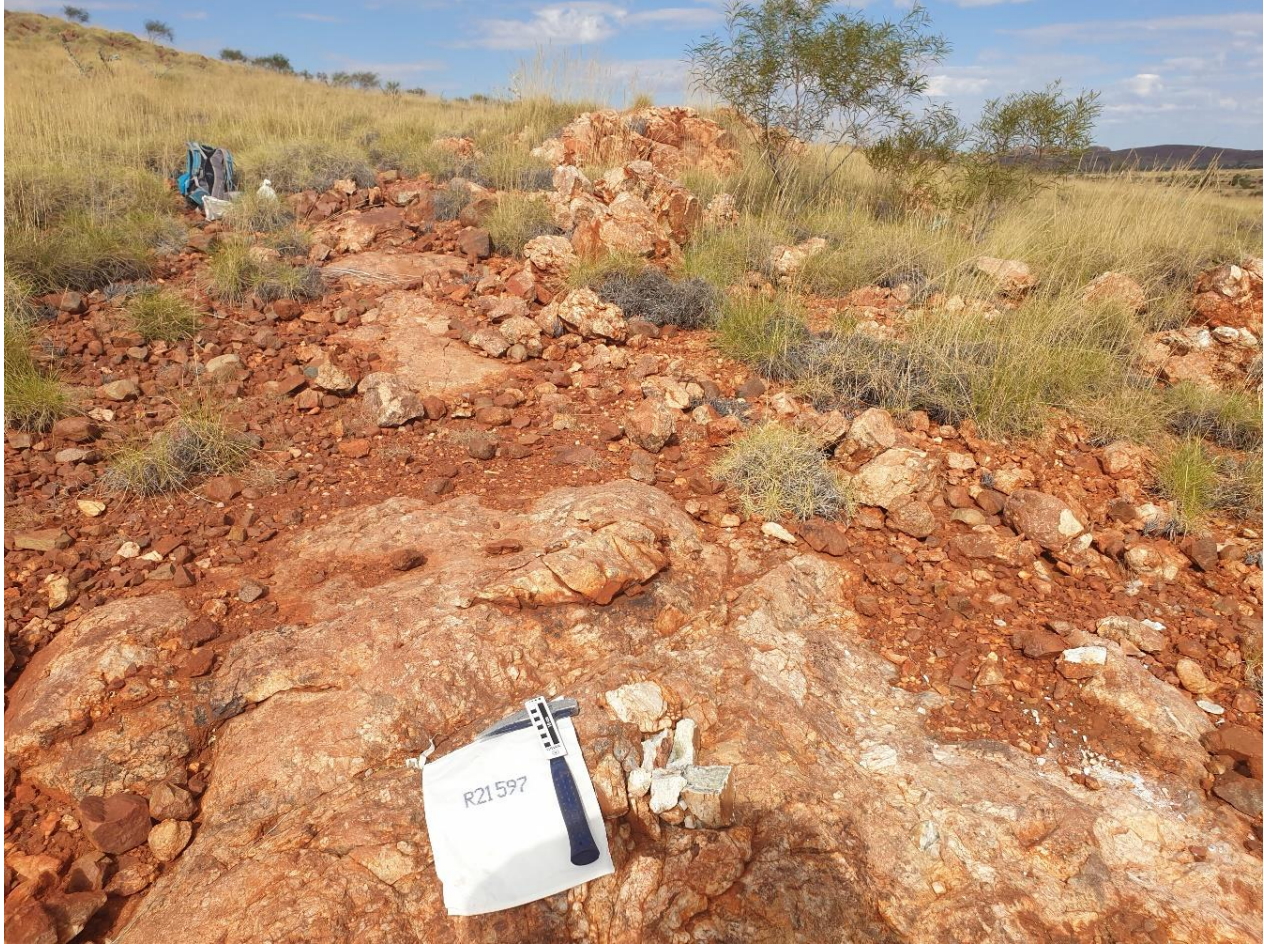
Figure 2: Andover South Project – Outcropping Pegmatite within E47/4062 4

This ASX announcement has been authorised for release by the Board of Raiden Resources Limited.