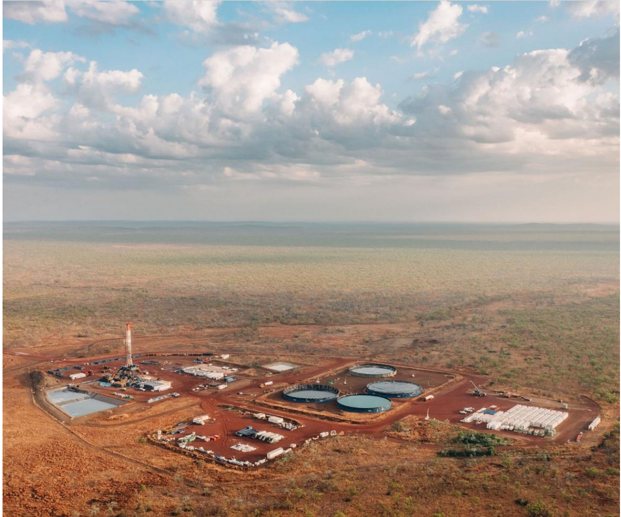
Figure 1: Drilling operations completing in EP 161, November 2021