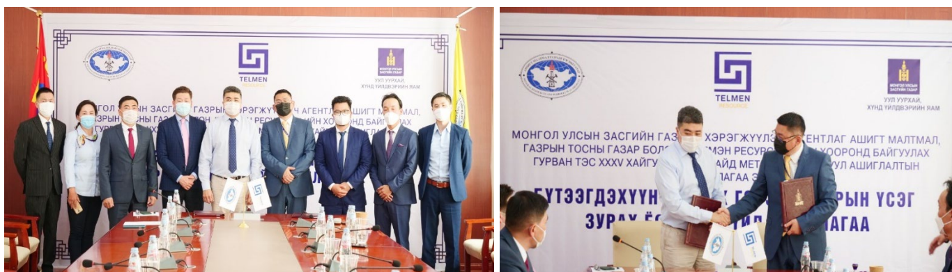
PSA Signing Ceremony – Ulaanbaatar, Mongolia