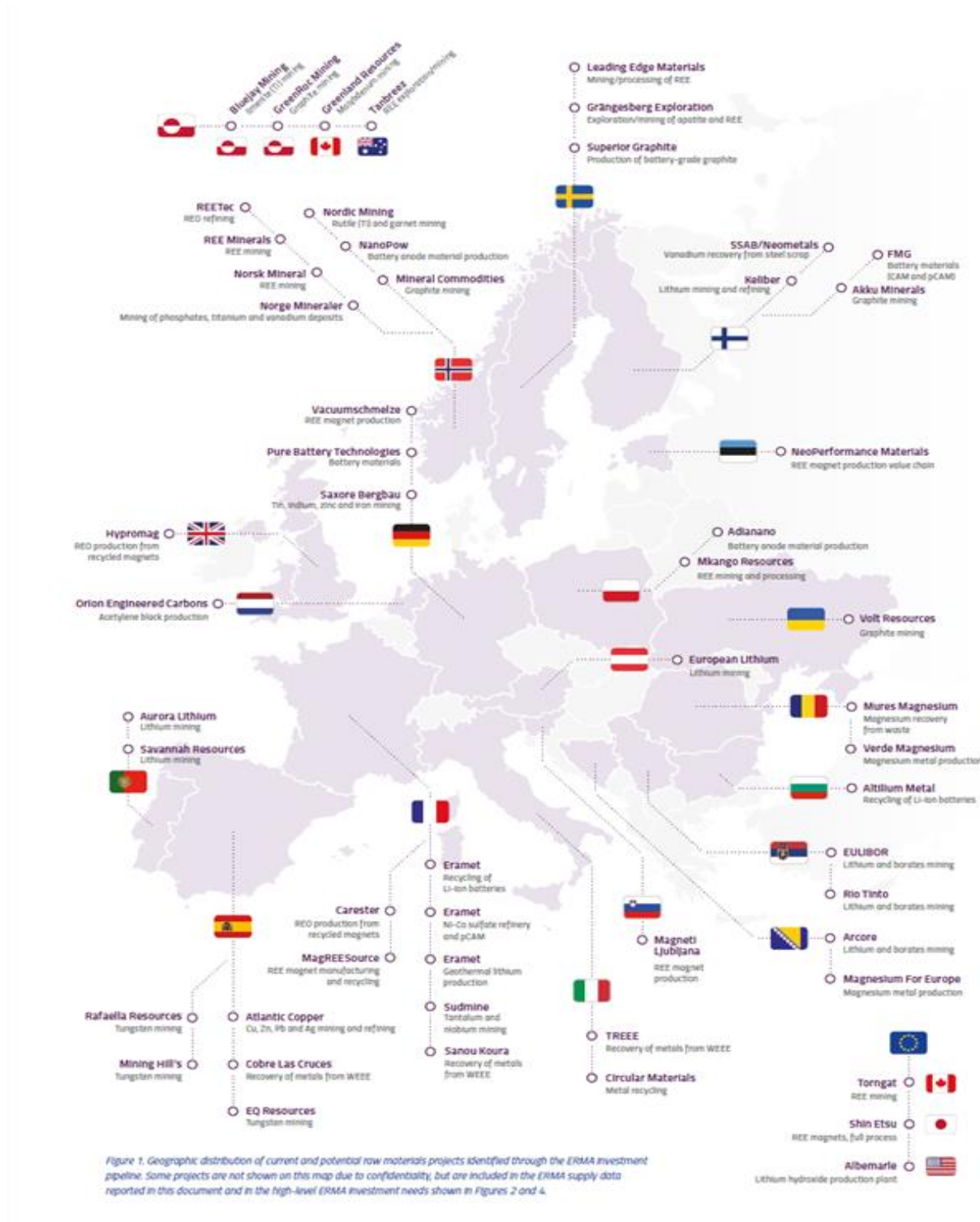
Figure 1: Raw Materials Projects Identified in ERMA Investment Pipeline.

makes Europe an attractive market opportunity for Volt”.