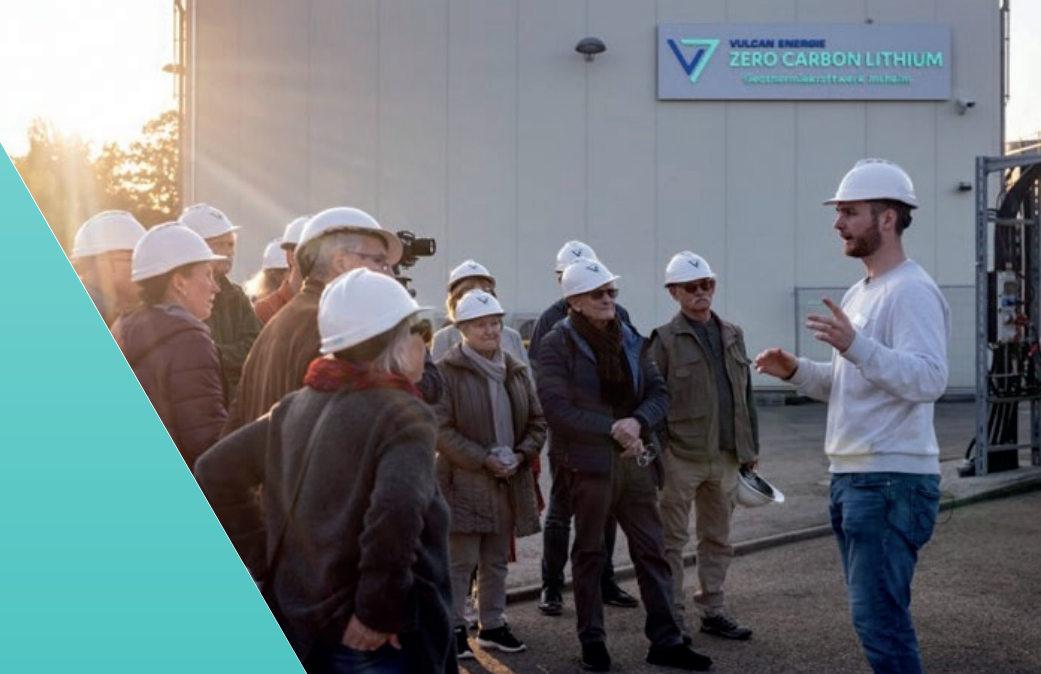
Open Door Day at Vulcan's Natürlich Insheim geothermal renewable energy plant in May 2024