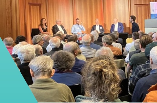
Local community engagement meeting