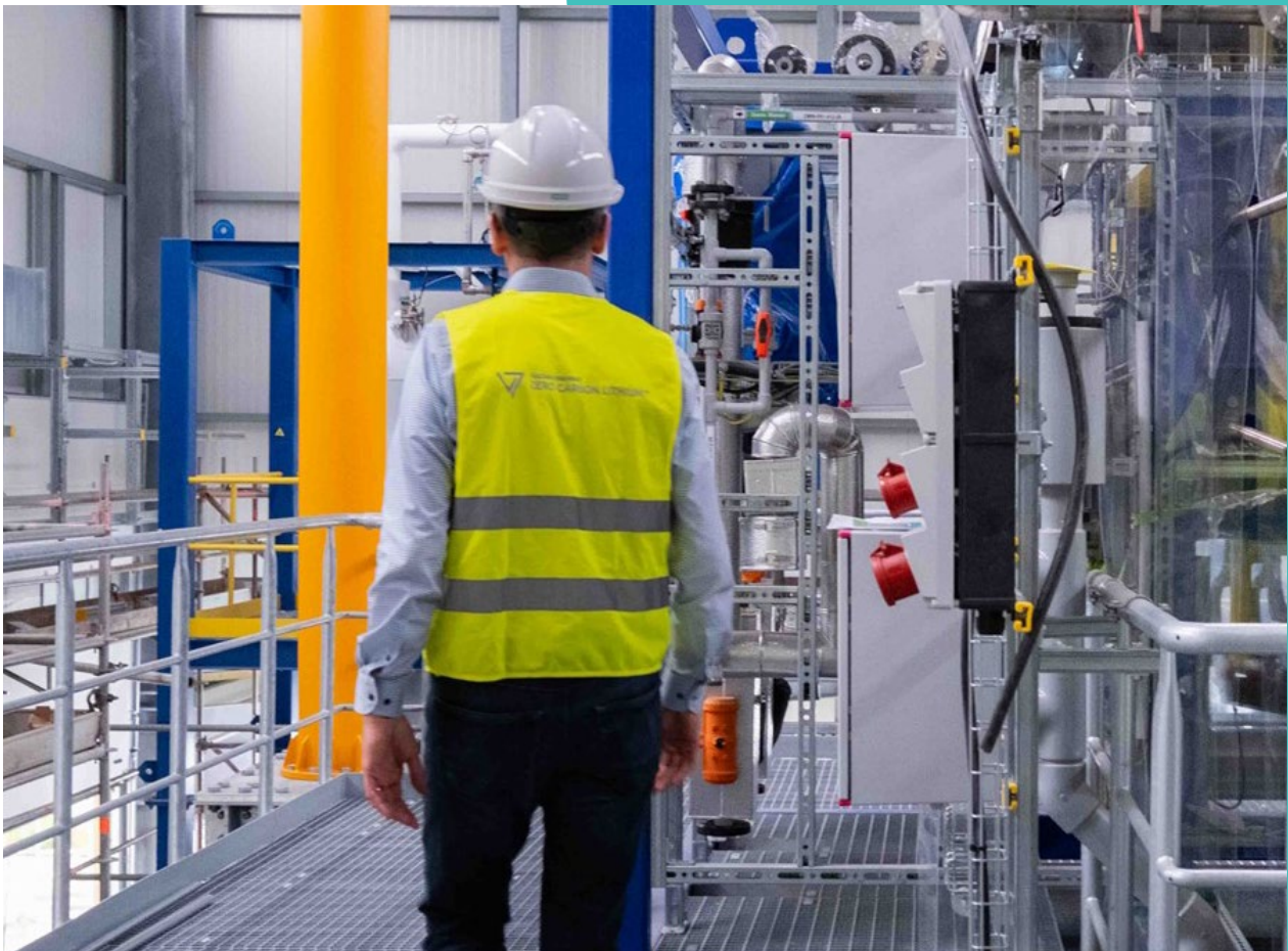
Process Mezzanine at Vulcan's CLEOP.